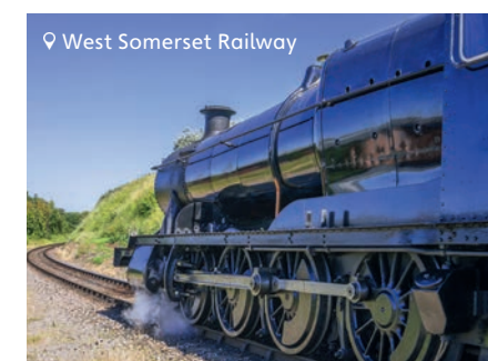
West Somerset Railway