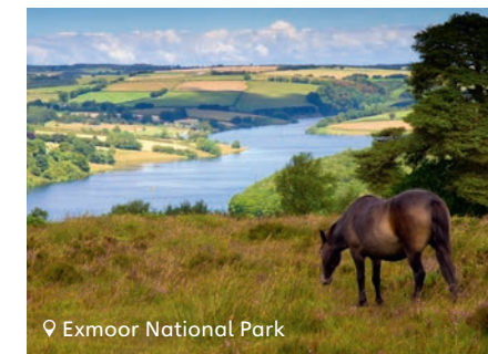
Exmoor National Park